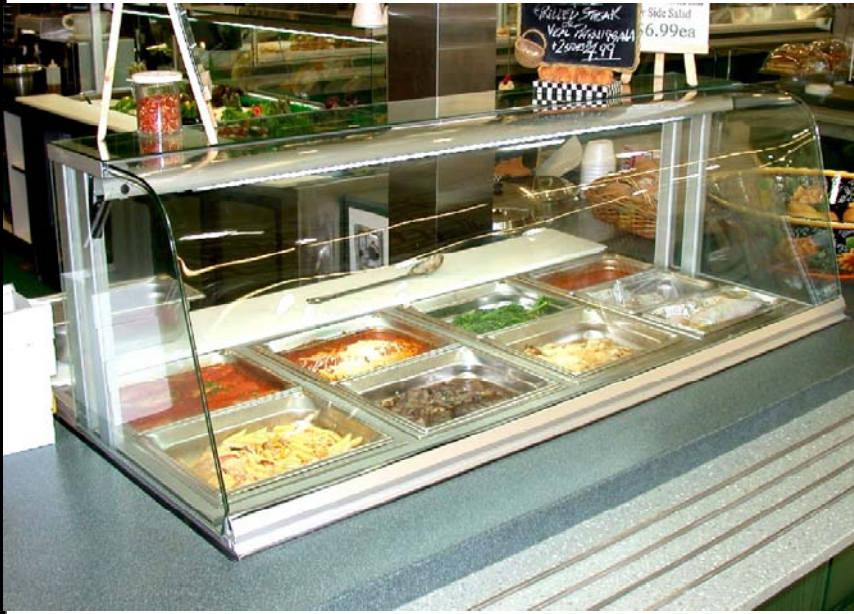
Manufacturers of food service displays