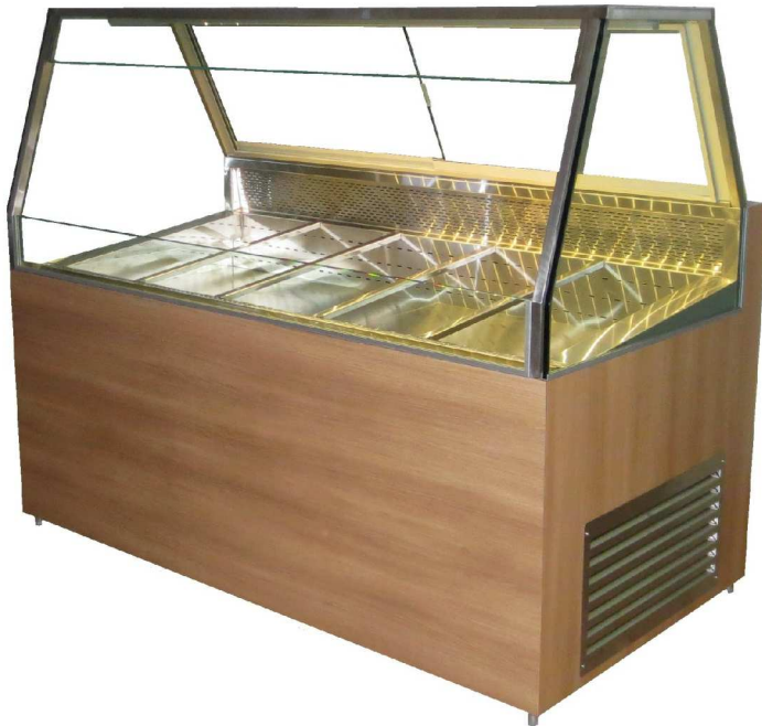
Manufacturers of food service displays