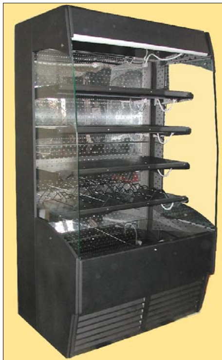
Manufacturers of food service displays