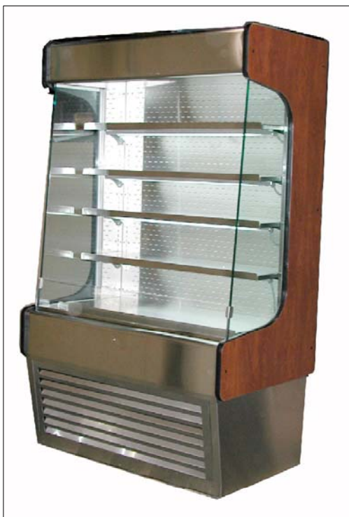
Manufacturers of food service displays

NOTE: DRAIN RECOMMENDED * DIRECT DRAIN REQUIRED FOR WC7281, WC8481, WC9681.