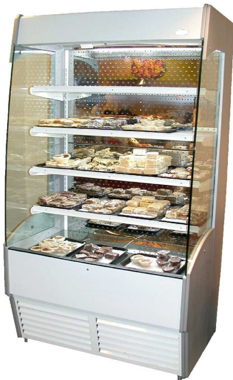
Manufacturers of food service displays